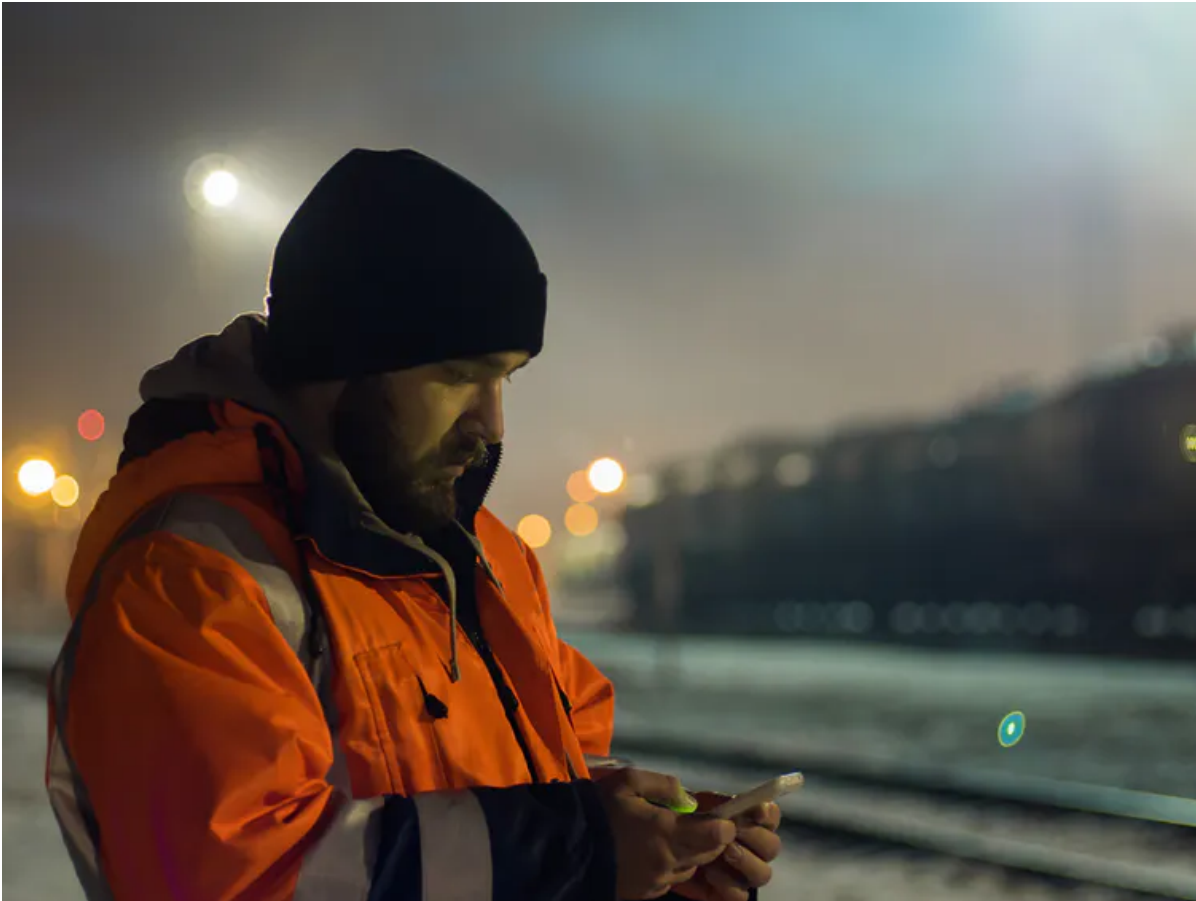
Working shifts has serious implications for your health.

Shift workers try to sleep during the day, but sleep is usually shorter and of poorer quality than when sleep occurs at night because, although desperately tired, the circadian system is instructing the body that it should be awake. They then work during the night at a time when the circadian system has prepared the body for sleep, and alertness and performance are low. In effect, they work when they are sleepy and sleep when they are not.